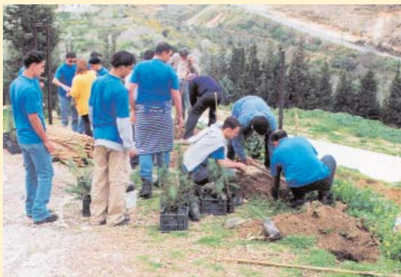
Participating in the Green Campaign