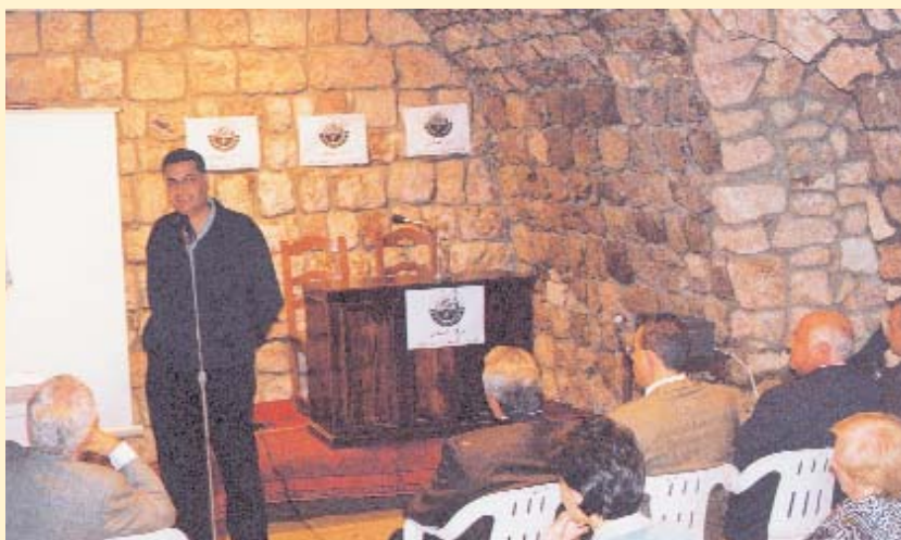
Seminar in Tannourine on apple maggot disease

These seminars took place in villages and towns in Batroun, Koura and Akkar.