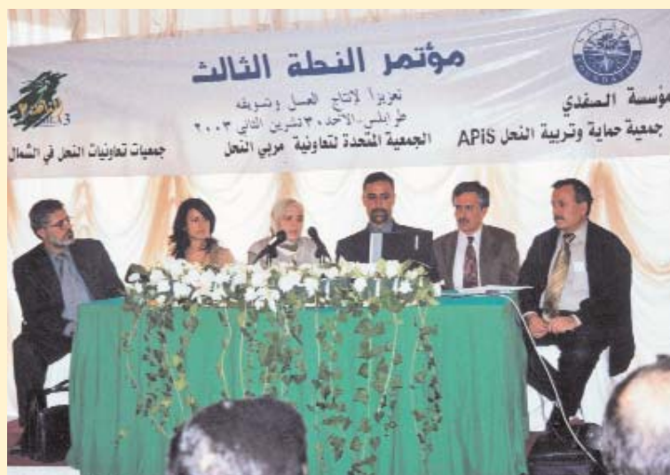
Participants at the conference's opening session

In coordination with Beekeepers Without Borders and Beekeeping Cooperatives in Lebanon, the Foundation organized the Third International Conference on Beekeeping and Honey Production, which resulted in a number of proposals and recommendations to improve product quality and marketing in this sector.