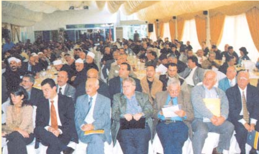
Participants and beekeepers at a seminar