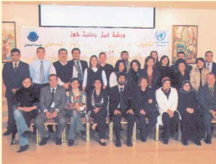
Local community development stakeholders who received training from the Foundation and ESCWA

As part of a cooperation agreement between the Foundation and the Economic and Social Committee of Western Asia (ESCWA), two workshops were held to prepare specialized trainers in local community development. Over 40 people benefited from the training program, a number of whom were selected to carry out development projects in Tripoli and North Lebanon.