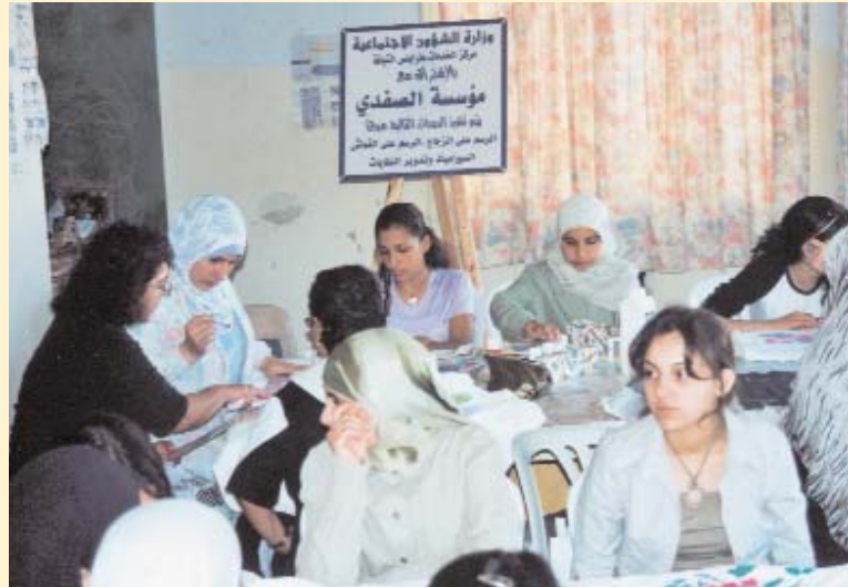
Women train in painting and creating mosaics

In cooperation with the Ministry of Social Affairs Development Services Center-Bab al-Tabbaneh- the Safadi Foundation has carried out training courses in developing such handicraft skills as making artificial flowers, painting on glass and material, and creating mosaics. These courses aim to support and encourage women to acquire productive artistic and artisan skills so that they can then sell their products and obtain a financial return. Forty-five women from different ages benefited from these courses during 2003.