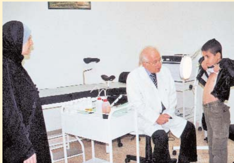
A check-up at the Center for Treating Dermatological Diseases

The Foundation's clinic started operating in October 2003. It provides diagnoses and treatment for skin diseases. Approximately 100 check-ups are carried out each week.