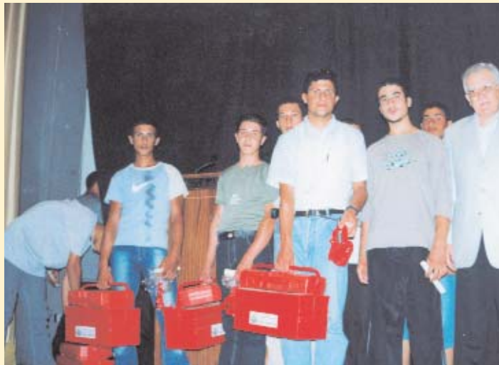
Vocational trainees receive their work equipment from the Safadi Foundation

158 trainees between the ages of 12 and 18 have benefited from the courses and the Safadi Foundation provided them with work equipment and tools.