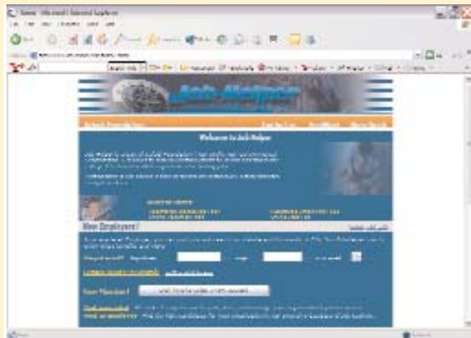
The Job Helper website

The Employment Center has received 500 job applicants since its establishment in 2001, and secured jobs for 20% of them.